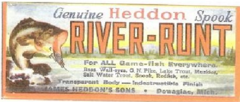
Upleaping Bass box with red mouth 1940 - 1947

It is interesting to note that the early #9109/#9409 River Runts were 1/8 ' longer and slightly heavier than the later baits. In the 1938 catalog the #9119 is changed to 2 1/2" and 1/2oz, the #9409 changed in 1946 to 3", 1/2oz. All these baits had 2pc hardware and exhibited a scale pattern down the side which was changed to a straight line after the war.