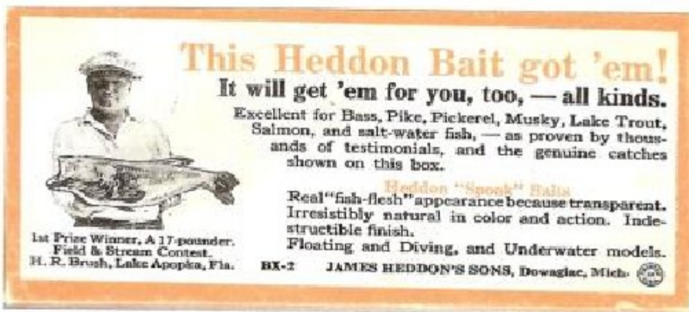
H.R. Brush Box, Lake Apopka, Fla 1934 – 1945