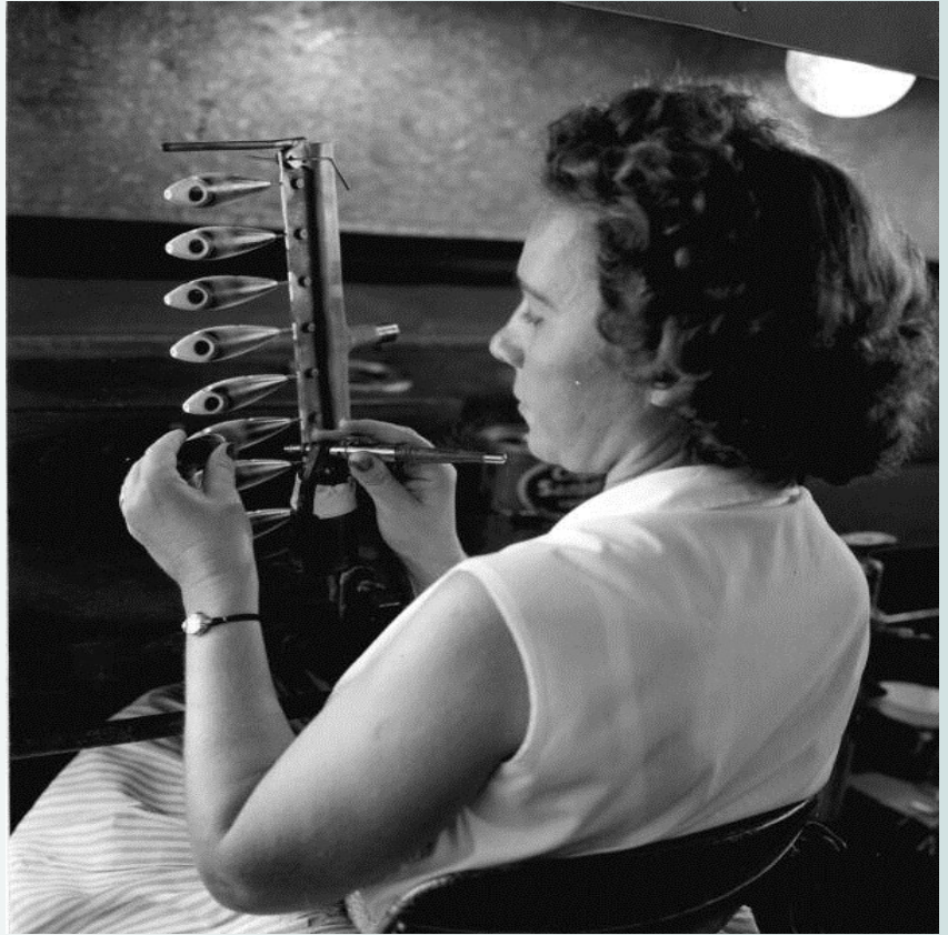
An employee airbrushing lures at a fishing tackle company—St. Petersburg, FL

November 18-20, 2011 CATC Fall Show Myrtle Beach, South Carolina