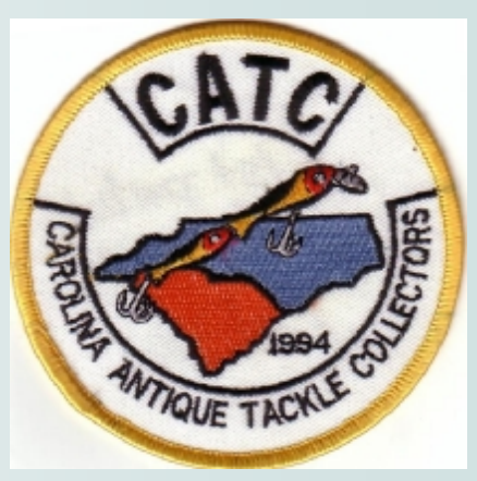
Issued 1994 Gasque Crawler

Issued to commemorate the tenth anniversary of the CATC