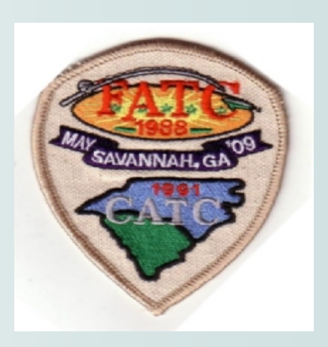
Issued 2009 CATC / FATC Combined

Issued to commemorate the combined show hosted by CATC and FATC in Savannah