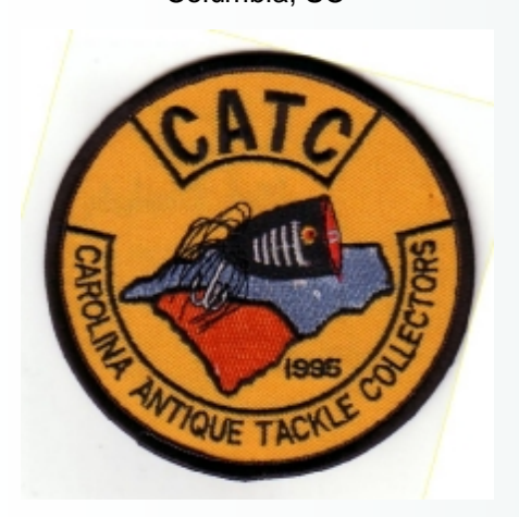
Issued 1995 Tarheel Flapper

Produced in the 40's-50's by Scooterpooper Sales, Inc. in Columbia, SC