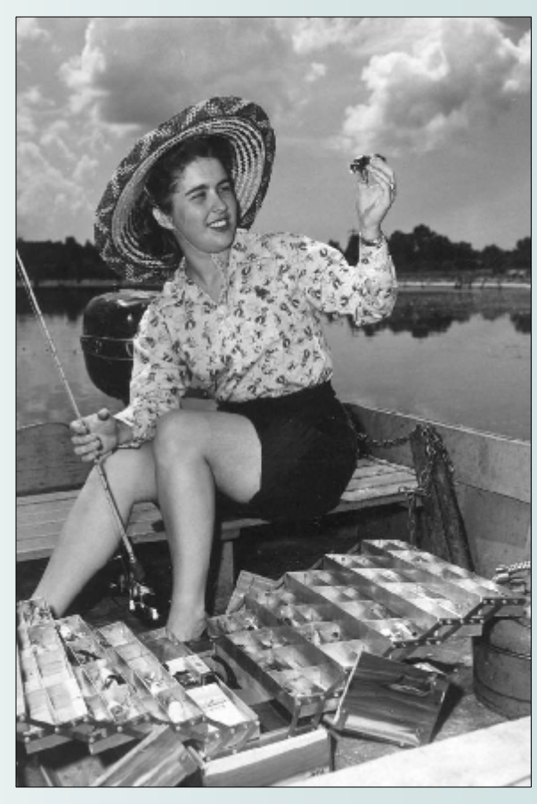
So many to choose from......

November 19-21, 2010 CATC Fall Show Myrtle Beach, SC