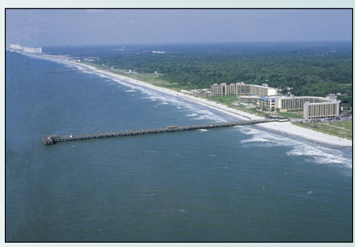
The Springmaid Resort and Pier at Myrtle Beach

Additional information will be announced as it becomes available.