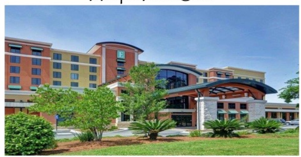
A Combined Show in Historic Savannah, Georgia, Presented by the Carolina Antique Tackle Collectors & Florida Antique Tackle Collectors November 11-12, 2022

Embassy Suites by Hilton, Savannah Airport 145 W. Mulberry Blvd, Savannah, Georgia 31407