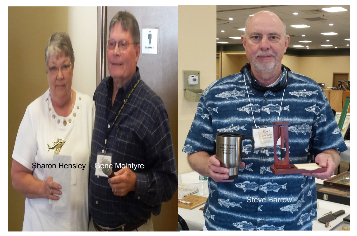
Carolina Antique Tackle Collectors Current Events