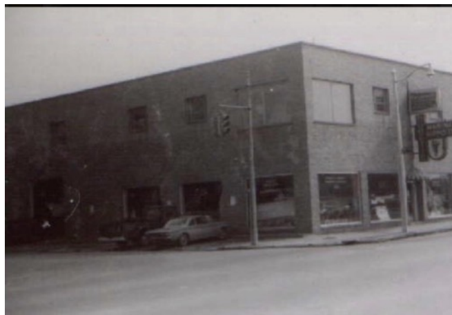
A view of 1 South Summit Street on the Maumee River, the 1939 location of Bodette Marine.