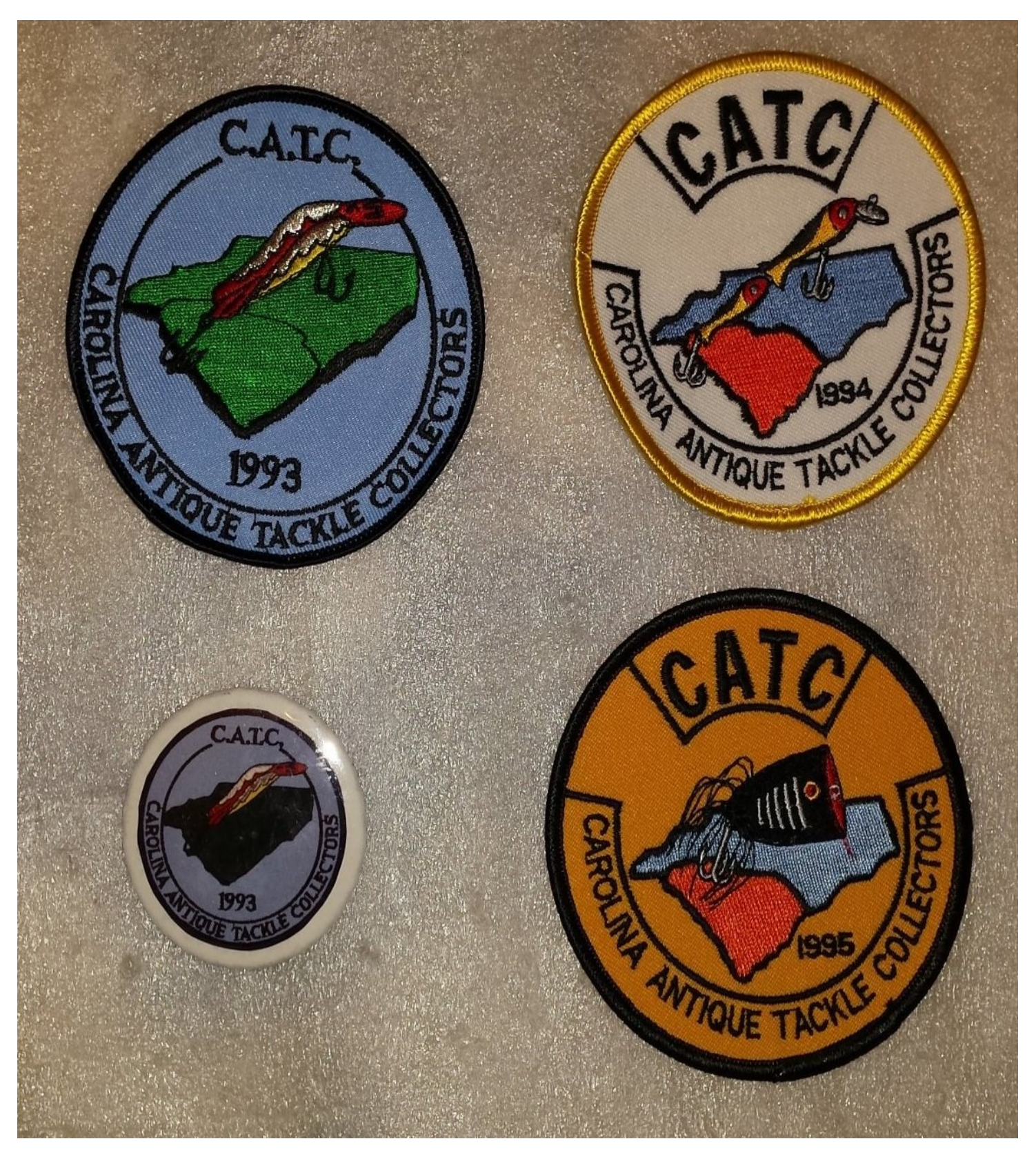
These historical CATC patches and pins will be available for sale to members at the Myrtle Beach show in November for $5.00 each. If you cannot make it to the show, or if you cannot wait that long, you can purchase them through the mail from Steve Barrow. To cover postage and materials, the first item sent by mail will be $10.00, and all additional items $5.00 each. Make checks payable to CATC, and send to Steve Barrow, P.O. Box 487, Kittrell, NC, 27544.